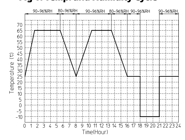
Fig 1. Temp. and Humidity Cycle