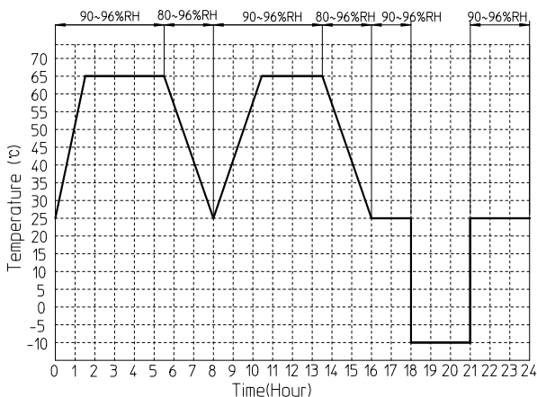
Fig 1. Temp. and Humidity Cycle