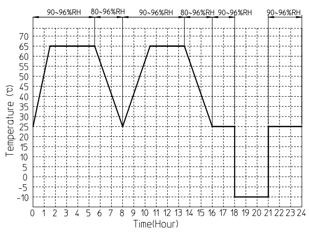
Fig 1. Temp. and Humidity Cycle